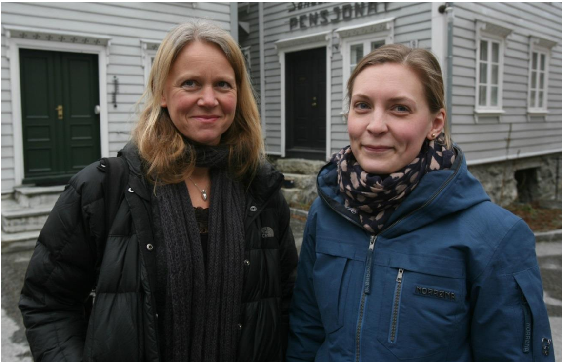
Figure 5: Being interviewed by Helg & Kvardag.

During our visit we were also interviewed by the local newspaper (Helg & Kvardag). We talked about the goals for the HOMERISK project and that we were interested in interviewing more households in Lærdal.