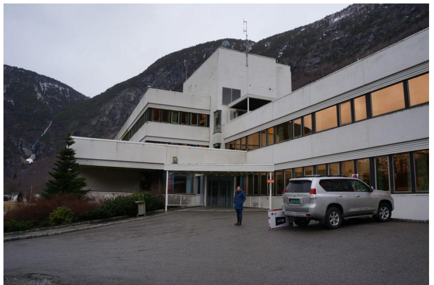
Figure 2: Visits to key locations in Lærdal. Outside The Volunteer Central (Lærdal Frivillighetsentral), and outside Lærdal hospital.